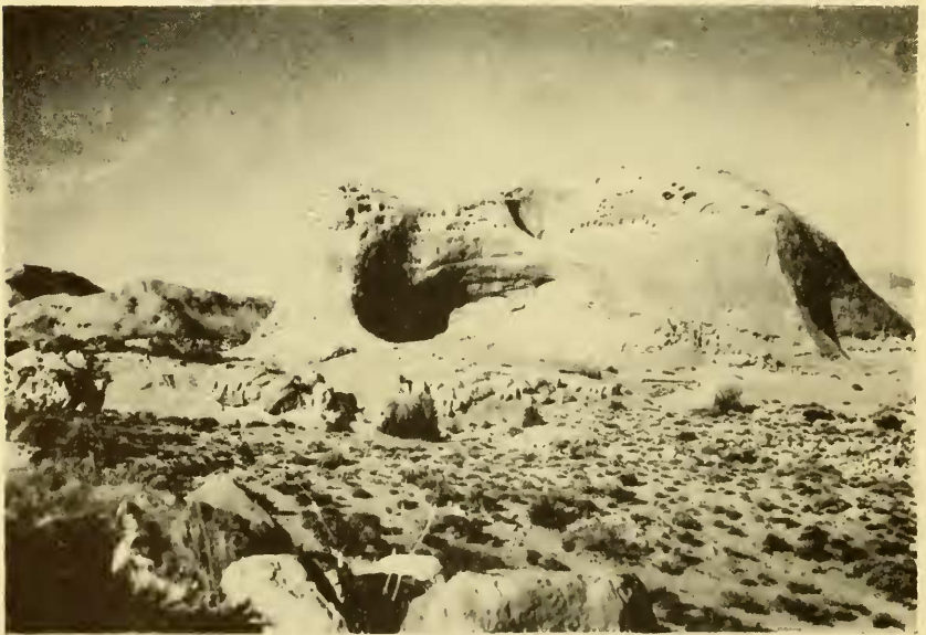
Figure 6. The Hall, showing the manner in which the Entrada Sandstone (Jurassic) weathers. The plant cover is mainly Blackbrush, Colcogyne ramosissima . (Photo by D. E. Beck, 1938.)